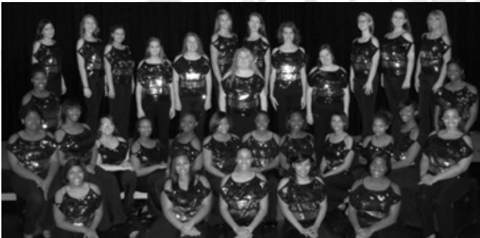
Warren Central Expressions