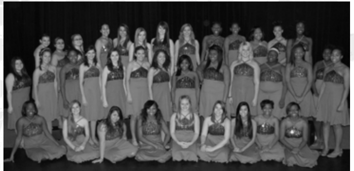
Warren Central Hi-Lites