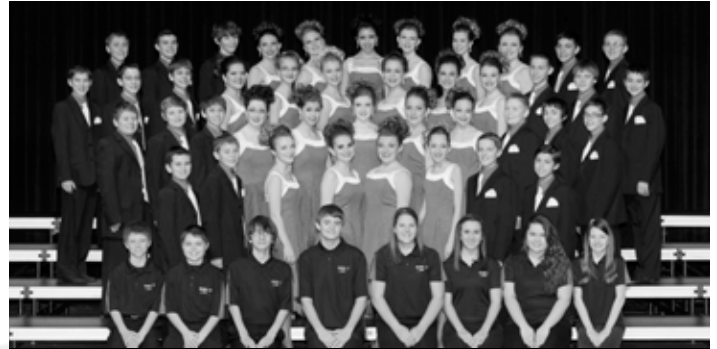
Edgewood Mini Warehouse

Center Stage is celebrating their third year as an all-female choral ensemble; and the newest addition to the Edgewood Junior High music department! This group is made up of 32 performers from the seventh and eighth grades. There is a behind the scenes crew of eight students and a show band of eight instrumentalists. In 2012 Center Stage was privileged to have received 1st Runner-Up honors at three contests, performing in the mixed junior high division! Their contest season this year enjoys stops at Loveland, Center Grove, Franklin Central, and Fairfield high schools. Center Stage wishes the best of luck to every choir performing today!