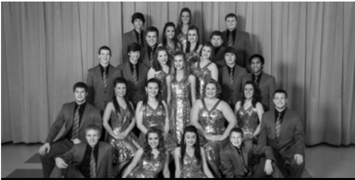
Whiteland Rhythm Masters