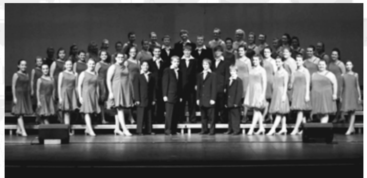
Southmont Young Originals