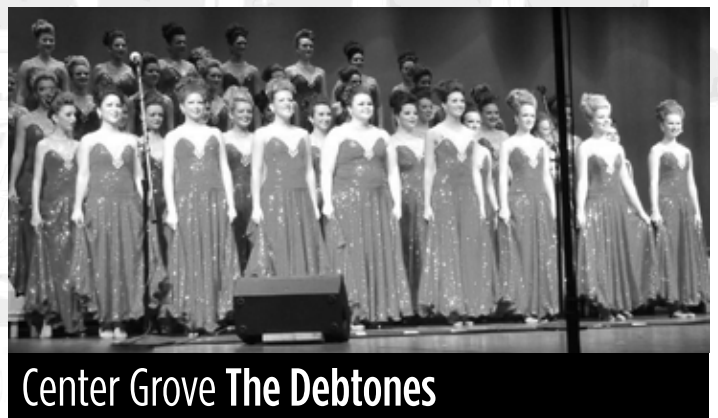
Center Grove The Debtone