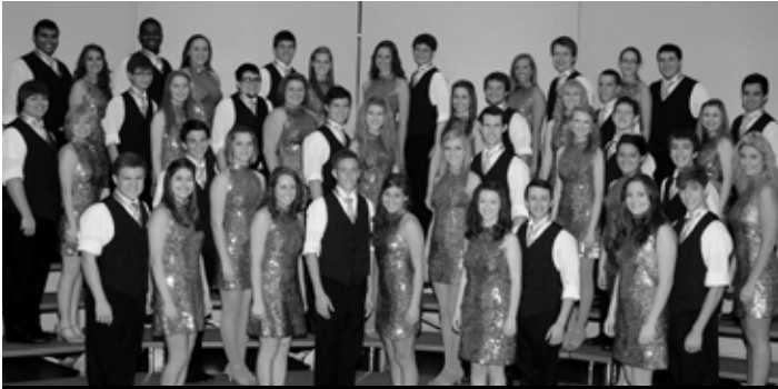
Brownsburg Spotlight Singers and Co.

Brownsburg High School Spotlight Singers & Company contains 43 singers and dancers, 12 instrumentalists, and 14 stage crew members. All singers are also members of Brownsburg's concert choir, "Madrigal Singers". They are consistent competition finalists and enjoy any opportunity to perform. They have won awards for vocals, choreography, instrumental performance, and stage crew. They hope you enjoy the variety and styles of music presented today. They are excited to perform and cheer for other choirs.