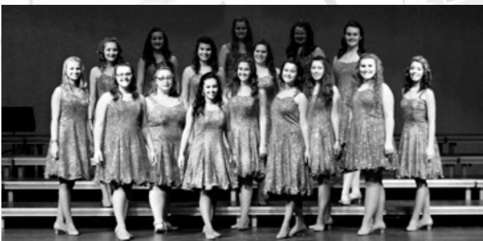
Southmont Sudden Impulse