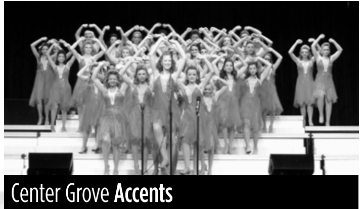
Center Grove Accents