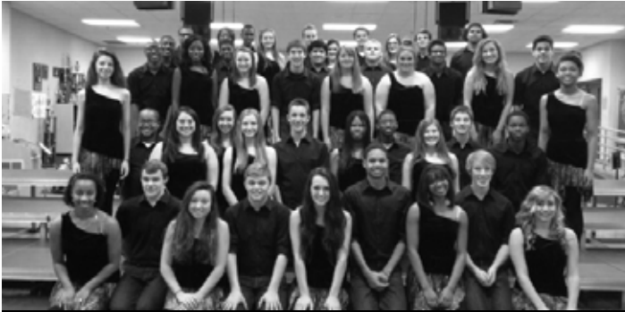
Lawrence Central Central Sound