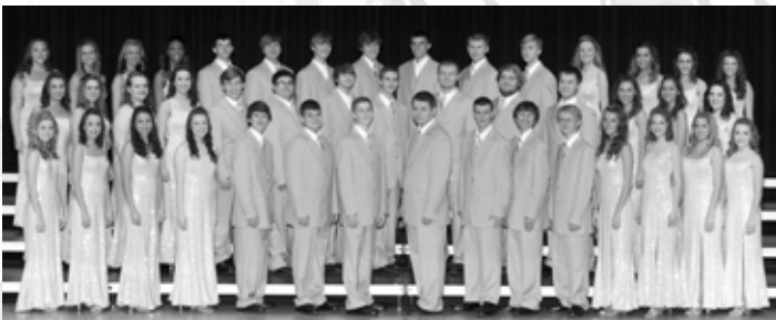
Edgewood Music Warehouse

Starlight Voices is a select women's ensemble from Brownsburg High School comprised of 52 singers and dancers, 12 instrumentalists, and 14 stage crew members. They have won awards for vocals, choreography, instrumental, and stage crew. This year, they will compete at Pike, Center Grove, and Avon. Selections Good Girl, Around Here, I Know You by Heart, Paris, and Outta My Head. They look forward to performing and supporting other choirs.