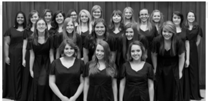
Pendleton Heights Starlite Serenades