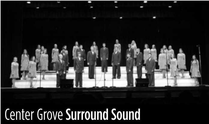
Center Grove Surround Sound