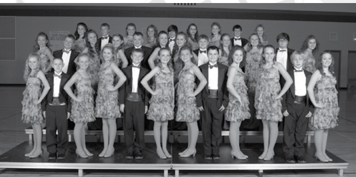
South Dearborn Showcase

Mini Warehouse has been entertaining audiences for over twenty years as one of the most established junior high show choirs in the Midwest! This group is made up of 42 performers, a crew of 8, and a band of 8 instrumentalists from the seventh and eighth grades. Over recent years, Mini Warehouse has performed on many stages in many states, achieving Grand Champion honors in several contests, including three times in 2012. Last year they were also named runner-up at Show Choir Nationals. They have also been privileged to sing the National Anthem for the Indianapolis Indians. Mini Warehouse wishes the best of luck to every choir performing today!