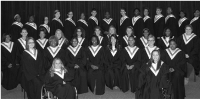
Warren Central Chamber Singers