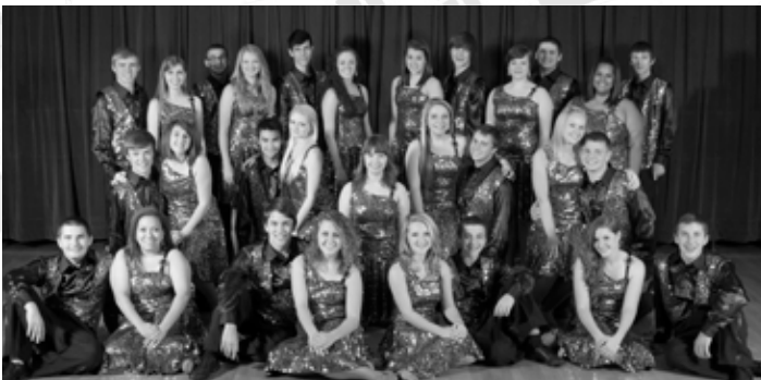
Pendleton Heights Pendletones