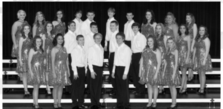
Edgewood New Edition

Music Warehouse is celebrating its thirty-seventh spectacular year in 2013. This ensemble has gained national recognition through competing successfully, and gaining Grand Champion status, in various contests throughout the United States. Over these past four decades, they have been privileged to compete in Los Angeles, Chicago, New York, and Orlando. They have also been recognized by the General Assembly of the state of Indiana for excellence in music. In 2013, Music Warehouse will compete at Fishers, Danville, Loveland, Center Grove, and Fairfield. They are comprised of forty-six singers/dancers and a backup band of eleven. They wish the best of luck to all of the choirs competing today!