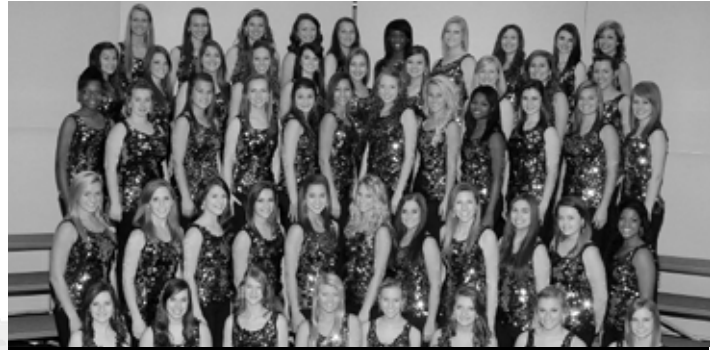
Brownsburg Starlight Voices

Brownsburg High School Spotlight Singers & Company contains 43 singers and dancers, 12 instrumentalists, and 14 stage crew members. All singers are also members of Brownsburg's concert choir, "Madrigal Singers". They are consistent competition finalists and enjoy any opportunity to perform. They have won awards for vocals, choreography, instrumental performance, and stage crew. They hope you enjoy the variety and styles of music presented today. They are excited to perform and cheer for other choirs.