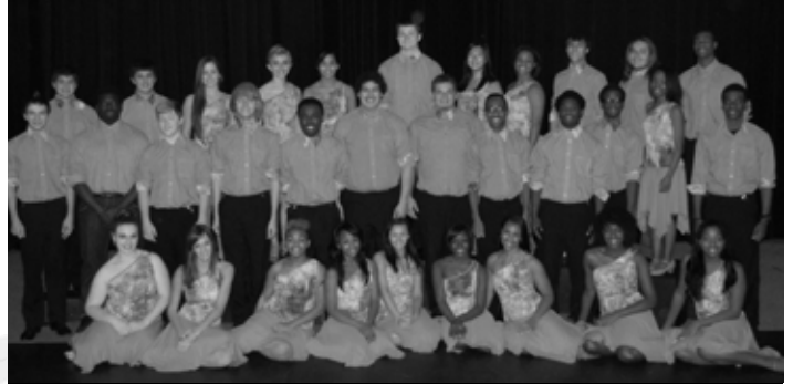
Warren Central Connection