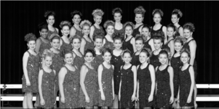
Edgewood Center Stage

Center Stage is celebrating their third year as an all-female choral ensemble; and the newest addition to the Edgewood Junior High music department! This group is made up of 32 performers from the seventh and eighth grades. There is a behind the scenes crew of eight students and a show band of eight instrumentalists. In 2012 Center Stage was privileged to have received 1st Runner-Up honors at three contests, performing in the mixed junior high division! Their contest season this year enjoys stops at Loveland, Center Grove, Franklin Central, and Fairfield high schools. Center Stage wishes the best of luck to every choir performing today!