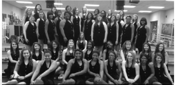
Lawrence Central Sweet Sensations