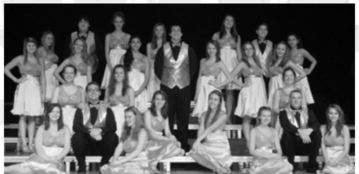
Triton Central T.C. Singers