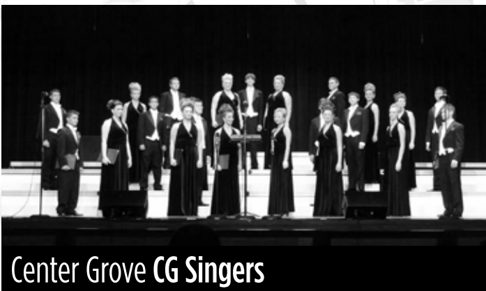
Center Grove CG Singers